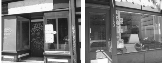
Above: The Brereton Street side of the building has two storefronts, as does the Dobson Street side (pictured below). There are potentially four rental units on top.

If pursued, the scope of this project could span years and millions of dollars. Realizing that the PHCA lacks the resources, staff and technical expertise to go it alone, members voted to seek assistance from the Bloomfield-Garfield Corporation (BGC). The